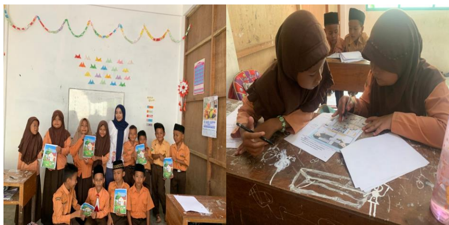
Figure 4. Learning activities using comic media