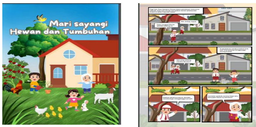
Figure 2. Display of Comic Learning Media

The (design) stage of product design that will be developed in this research is the learning media in the form of comics, comics which are given the title "Let's Love Animals and Plants" which are taken from the Thematic Subject II student book (see Figure 2). The comic is depicted with a story full of interesting, imaginative cartoon images. By developing the comic, it will improve children's reading comprehension.